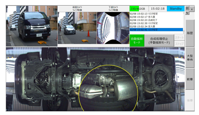
Zoom Function for Inspection